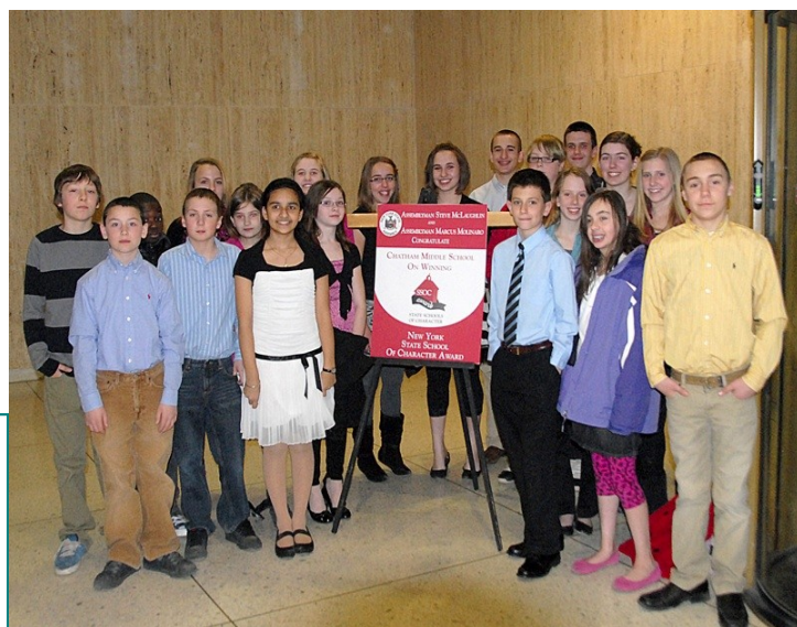
Chatham Middle School Students at their NYS Assembly Visit

Share with Leadership/Curriculum Teams Administrators/Principals School Staff