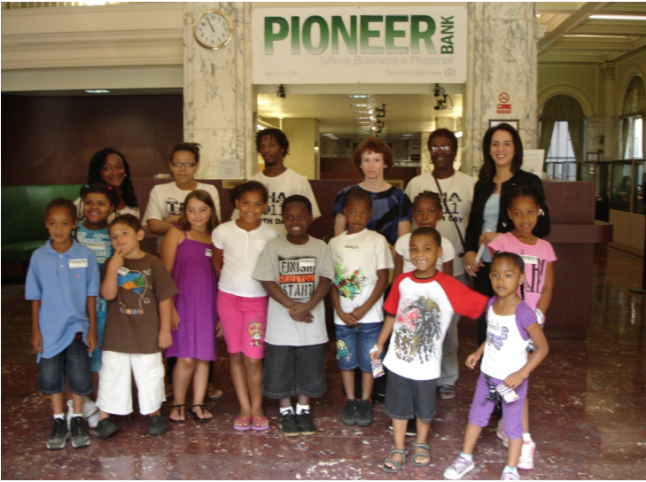
Fieldtrip to Pioneer Bank, in Troy, NY Pioneer Bank is one of our sponsors and neighbors.