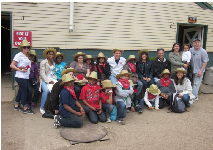
Walnut Street School, Uniondale School District, at the Sweet Hills Riding Farm

When asked about their favorite aspect of being a mentee, two students responded, “My mentor's actions changed me and influenced me to share” and “my favorite thing about mentoring is how my mentor cares about me and me about him.”