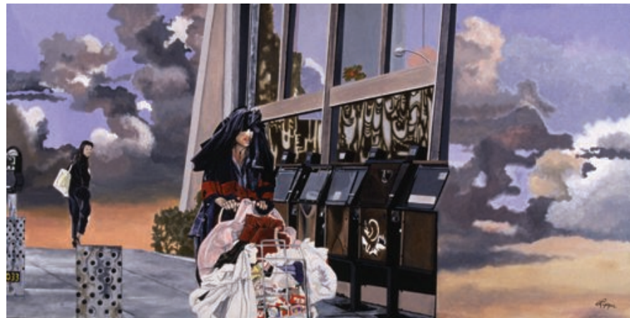
[17] Linda Lippa Bag Lady 1987, Acrylic on canvas, 24x48"