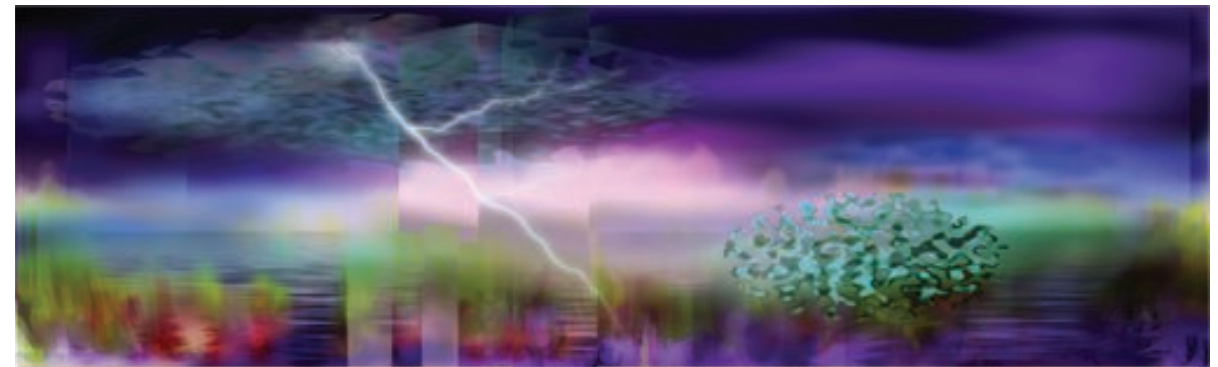
[6] Mildred Kaye View from the Meadowlands 2004, Digital print, 15x33"

Barbara Baird's vivid paintings guide us along the double yellow lines that mark the roads which lead out of metropolitan regions. Blue Road in Autumn and Winter Road each cut an energetic path through the landscape, between the trees, sizzling with colorful leaves in the fall, and reduced to woody tissue in winter. The firm gash of the road surface and the double yellow lines convey a sense of urgency with which to reach the goal beyond the horizon. While the place to which we travel remains invisible from our view, we desire it with the same intensity as the energy of the road itself.