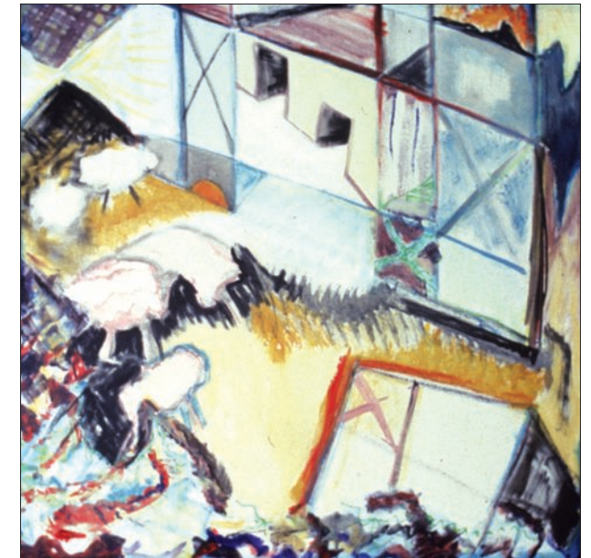
[20] Roberta Crown Hyperspace #15 2000, Acrylic on canvas, 37x37"