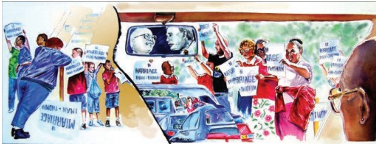
[19] Mildred Kaye Homophobicon 2005, Watercolor, 14x36"