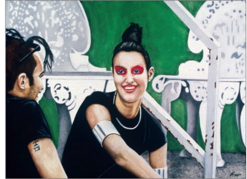
[16] Linda Lippa American Goth 2001, Oil on canvas, 30x40"

Linda Lippa also addressed these urban imports: "... I have attempted to portray the modern suburban existence in which Ozzie and Harriet are dead and the viewer is forced to confront the social and economic realities of the 21st century. In American Goth [fig.16], the blond-haired, blue-eyed suburban cheerleader flirting with the high school quarterback has been replaced by a goth who happily chats up an equally contemporary 'boy next door.' In Bag Lady [fig. 17], the 20th century suburban cottage with the white picket fence has been replaced with the 21st century realities of poverty and homelessness, which have invaded even the suburbs" (LL 11Jun 07).