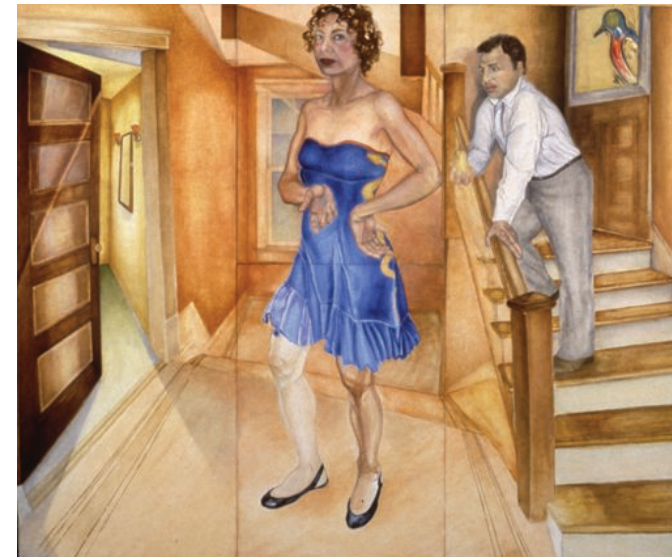
[18] Lisa D. Weinblatt Man/Woman 2 1997, Oil on canvas, 66x80"

The new characteristics of suburban households quantified by the 2000 census are also featured in the works of Lisa D. Weinblatt and Mildred Kaye. Weinblatt's School Lunch #6 depicts adult-size pupils from multicultural backgrounds. According to the artist, this painting is part of a series based on actual educational settings. Man/Woman 2 [fig. 18] depicts a private setting, the interior of a single-family home, but addresses a similarly contemporary topic, the "...changing and sometimes confusing roles of women in contemporary suburbia" (LW 13June 07). By the last decade of the last century, population and household dynamics of suburbs began to shift, and many inner-ring suburbs in the Northeast and Midwest acquired central-city-like characteristics, including population decline even in the face of increase in the total number of households. The existing infrastructure is becoming insufficient as growth occurs in single-parent and non-family households. Two-parent families with children have shrunk to 27 percent of suburban populations nationwide, surpassed by married couples with no children at 29 percent. 2 But some residents of suburbia attempt to resist the change, as Kaye's Homophobicon [fig. 19] portrays. Here, multi-racial residents of traditional backgrounds are joined together in active demonstration against the influx of same-sex couples.