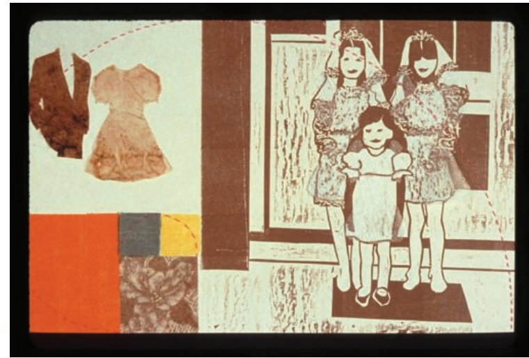
[13] Kelly Nelson Home 2006, Watercolor/mixed media, 9x15"

The script is like the softened silk of a wrapped cocoon, and the words are writ over and over to assure the bond between mothers and their children. This is the bond for which women let promising careers go, the bond through which happiness skills attempt to pass. The abstract elements in Kelly M. Nelson's Home [fig. 13] are equally evocative. "The square shapes are based on the Fibonacci numbers as well as the sewn spiral. The Fibonacci series represents healthy growth in natural objects, such as a conch shell and trees. The colors and images fit into this healthy growth and are connected by the spiral as I recall my childhood, happy, safe and healthy" (KMN 20June 07).