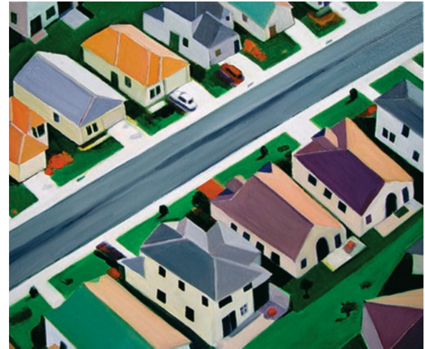
[1] Toni Silber-Deliverie Northeast Suburb n.d., Oil on canvas, 30x30"

Different types of single-family homes provided inspiration for the three artists who focused on this feature of suburbia. Neighborhoods with front lawns and small colonial style houses became popular at the same time the sitcoms on television expounded their virtues in the '50s and '60s. 1 Such regularly spaced and uniformly sized structures are the focus of Northeast Suburb [fig. 1] by Toni Silber-Deliverie. The artist considers "suburban tract housing a metaphor for predictability" (TSD 27 June 07), which was one of the features enjoyed by those who relocated from inner cities. Traditional suburbs from the Los Angeles area are the subject of Kay Lemoreaux Buckner's paintings. The streamlined design of the large single family home in Yesterday's Rainbows [fig. 2] reflects the glamour of the jazz age in Hollywood (KLB 27 June 07). The transforming nature of Hurricane Katrina in the suburbs of New Orleans impressed Willie Marlowe and her Flood Plain: New Orleans Suburb conveys the cavalcade of destruction caused by natural forces upon the man made structures.