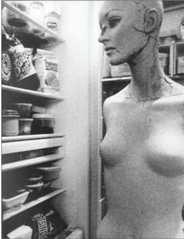
[14] Ennid Berger Suburban Contemplation 2003, silver gelatin print, 14x11”

Ennid Berger, on the other hand, restages some of the undesirable modalities of suburban communities. Suburban Contemplation [fig. 14] features an undressed and hairless female mannequin, elegantly posed facing the shelves of an open refrigerator. The opened door is behind her, enclosing the lean body within the wedge of space where the cold air escaping from the fridge is palpable. While we cannot identify the objects stored in the door pockets, we recognize the soft drink bottle and juice carton, plastic meat trays and leftover containers stacked on the shelves inside the fridge. This busy area on the left is divided by the strong edges of the shelves that converge toward the right and aim at the smooth body of the mannequin. Now we see the contrast between the smooth surfaces of the torso, and the surfaces of the head and neck, which have been cracked in patterns resembling injuries to human tissue. This contrast serves a double purpose. The mannequin can thus stand for the alienated self of a conforming woman who performs expected chores routinely, as well as represent the human suffering such restraint engenders even when living amidst material abundance. What then, is the substance of this suburban contemplation? Has this woman suppressed her self to such an extent that she has become indifferent to physical pain, and contemplative only of material abundance?