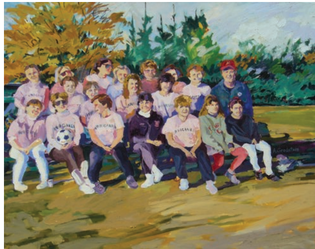
[8] Adele Grodstein The Hurricanes 1988, Oil on canvas, 38x46"