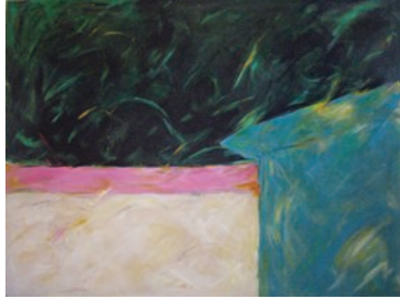
[5] Joanna First Summer's Shade 1994, Acrylic on canvas, 54x72"