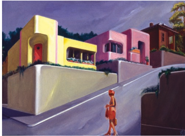
[2] Kay Lemoreaux Buckner Yesterday's Rainbows 1998, Oil on canvas, 28x38"