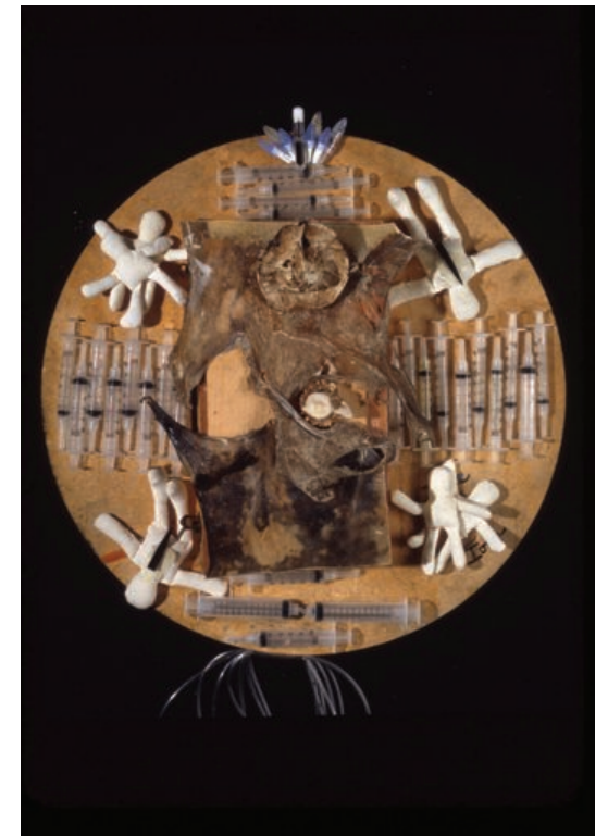
[15] lone Citrin Medicine Chest 2006, Mixed media, diameter 25”

Some of the ill effects of contemporary pressures are the subject of lone Citrin’s Medicine Chest [fig.15]. Here the target shape, blank voodoo dolls and multitude of hypodermic needles evoke the culture of overmedication prevalent among the comfortable inhabitants of the suburbs. But Citrin also calls attention to the psychological traumas and troubling realities that coexist with bliss as elements of urban living are transferred to the suburbs.