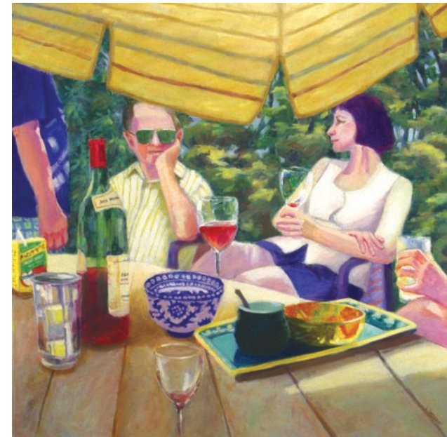
Ludlow Bix Smethurst Pic-nic 2001, Oil on canvas, 30X30"