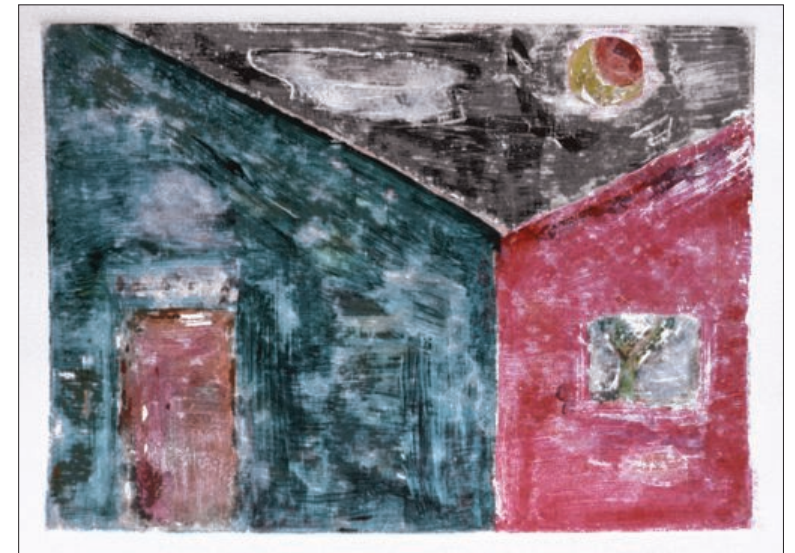
[4] Deborah Beck Night Dreams 1997, Monotype, 8x11"