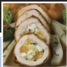
Apricot & Goat Cheese Chicken