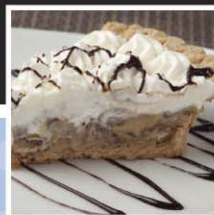
Praline Cream Pie

http://www.sage.edu/studentlife/dining/index.html