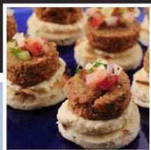
Grilled Pita Falafel and Vegetable Relish

Bold, Beautiful dishes will accent your catered event.