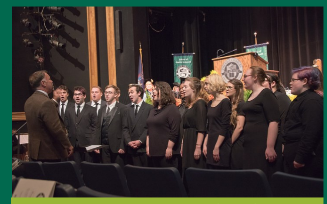
The Sage Colleges' Chamber Singers (above) and RSC Sagettes (below) brought music to the ceremony.