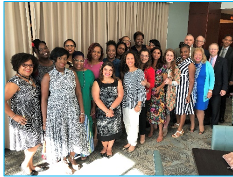
Members of NYC Cohort IV