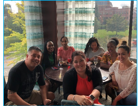
Members of NYC Cohort V