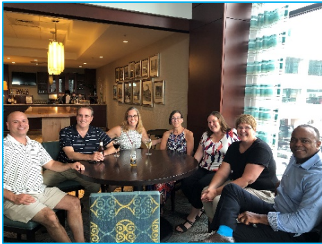
Members of Albany Cohort XI